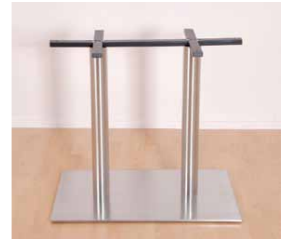
Illustrated without top - price includes top

Option 1: TDRPP PVC edge Option 2: TDRPS Sprayed, bullnose edge