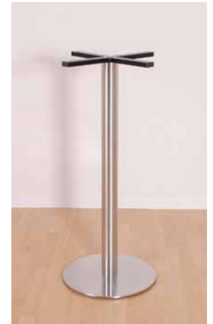
Illustrated without top - price includes top

Option 1: TPCP PVC edge Option 2: TPCS Sprayed, bullnose edge