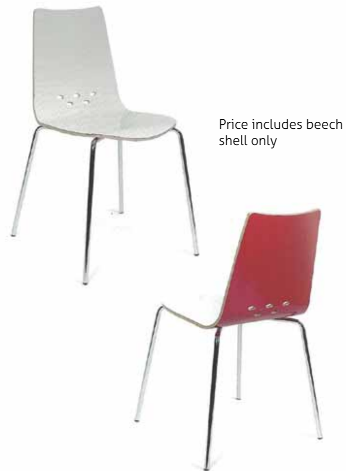
Price includes beech shell only

Item Number: 50 option 2 Product Code: Spoon Dimensions (mm): 500 (w) x 510 (d) x 460 seat height Description: One piece polished natural beech shell, 4 legged chrome tubular frame Delivery period: 4-6 weeks Guarantee Period: 3 years