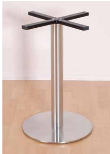
Illustrated without top - price includes top

Option 1: TDCPP PVC edge Option 2: TDCPS Sprayed, bullnose edge