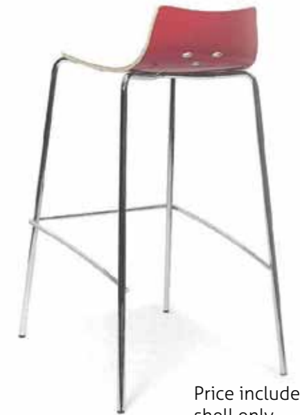
Price includes beech shell only

Item Number: 40 option 2 Product Code: Spoon SG Dimensions (mm): 370 (w) x 480 (d) x 770 (h) Description: One piece polished natural beech shell, 4 legged chrome tubular frame Delivery period: 4-6 weeks Guarantee Period: 3 years